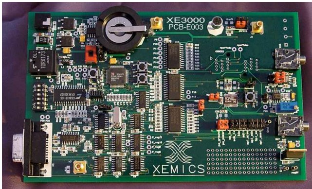
Development kit XE3000DVK and the PC Programming Interface

The XE3000DVK is the Development Kit suited for the evaluation of the electrical as well as audio performance of the XE3000 series products.